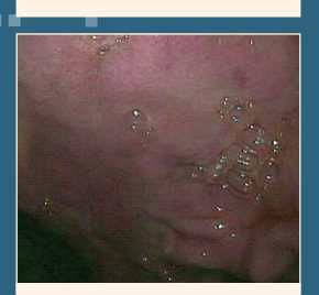
Figure 2: Abnormal region of stomach wall, with loss of normal rugal folds.