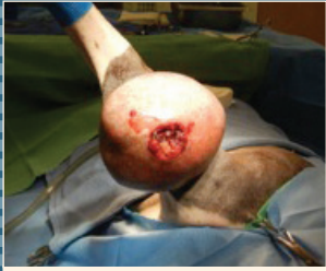
Figure 1: Large ulcerated neoplasia located at the flexor surface of the right elbow joint.

Surgeon – Veterinary Specialty Referral Center, Adjunct Associate Professor of Surgery – Albany Medical College