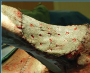
Figure 3: Several sutures are placed at strategic locations to anchor it to the recipient bed.