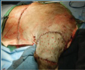
Figure 2: Full-thickness mesh graft used to close a large skin defect.